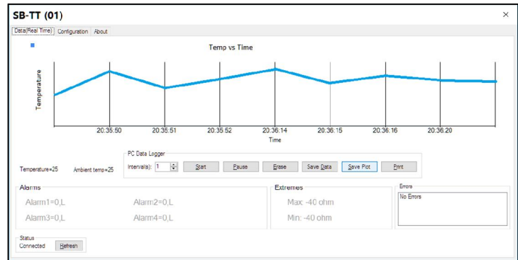
Figure 12 Device software- DATA (Real Time) Tab