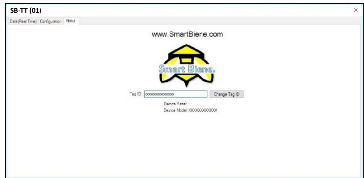
Figure 13 Device software- info Tab