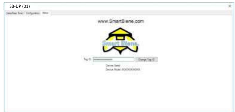
Figure 7: SB-DP(01) Info tab.