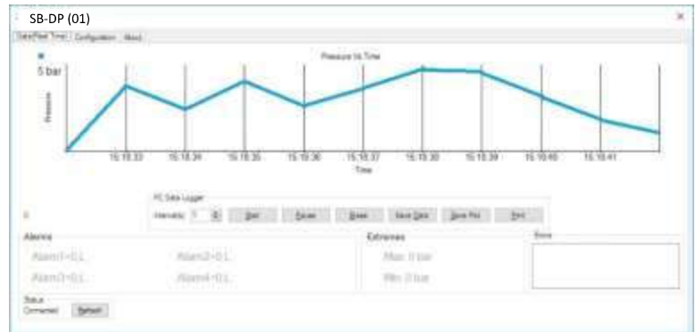
Figure 7: SB-DP(01) DATA(Real Time) tab.